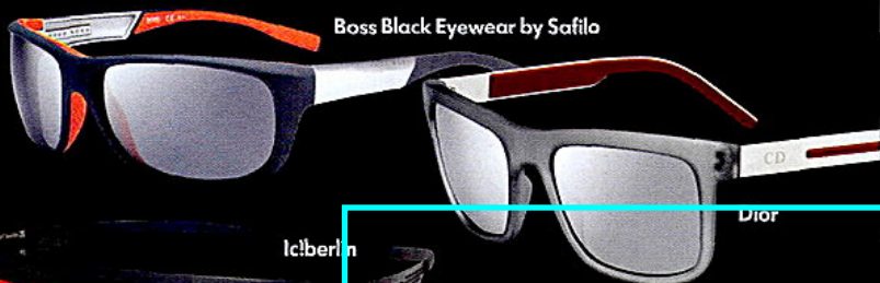
Boss Black Eyewear by Safilo